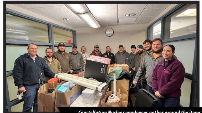
Constellation Nuclear employees gather around the items they donated to two EJD families during Christmastime.

Two Emerson J. Dillon Middle School families recently received a holiday surprise thanks to the generosity of one local company.